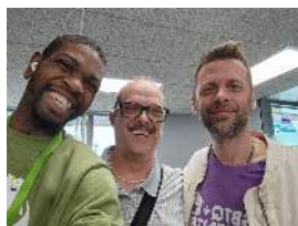
Kenneth Young Center