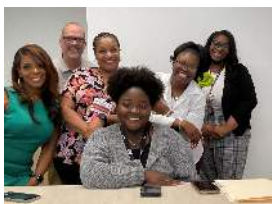
South Suburban HIV/AIDS Regional Clinics (SSHARC)

Here below are some of the people we have been able to meet with in person this year.