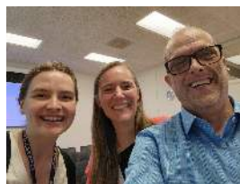
City of Evanston Health & Human Services Department