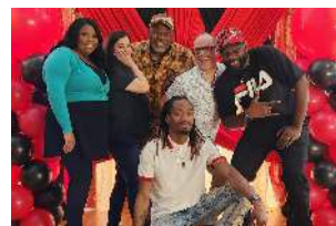
Chosen Family Network