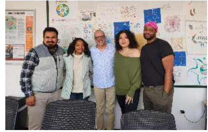
AIDS Healthcare Foundation / CALOR