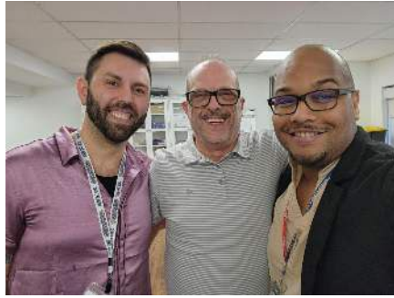
Chicago Center for HIV Elimination