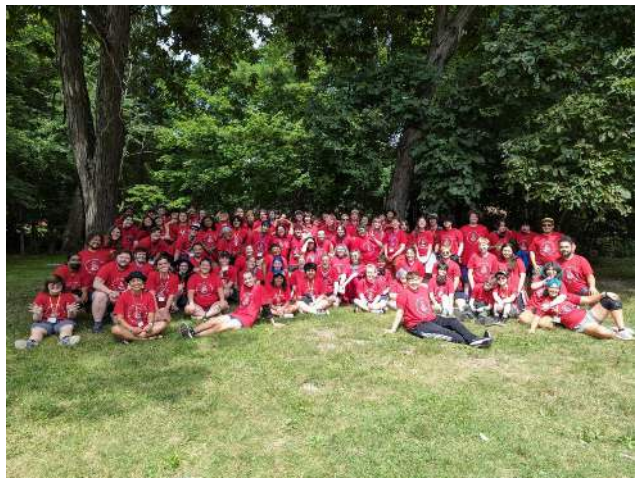
Action Camp 2023