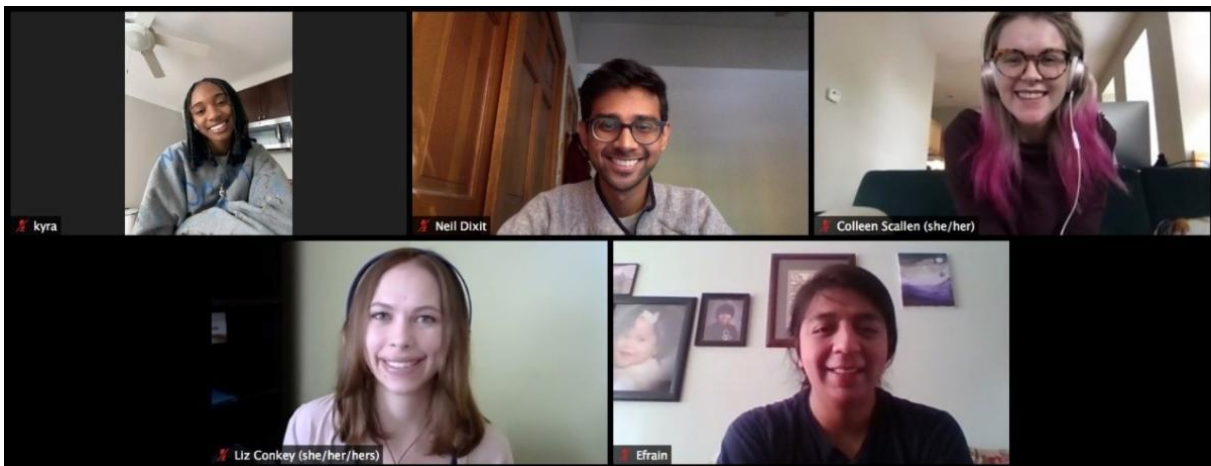
2020-2021 Substance Use Disorder (SUD) Allies AmeriCorps Members

This year, SUD Allies has nine new members engaging individuals in education, treatment, and recovery wraparound services. We are excited to collaborate this year with new and returning host site organizations: Broadway Youth Center, Chicago Women's AIDS Project, Erie Family Health Center, Haymarket Center, Healthcare Alternative Systems, Lurie Children's Hospital, and Trilogy Behavioral Healthcare.