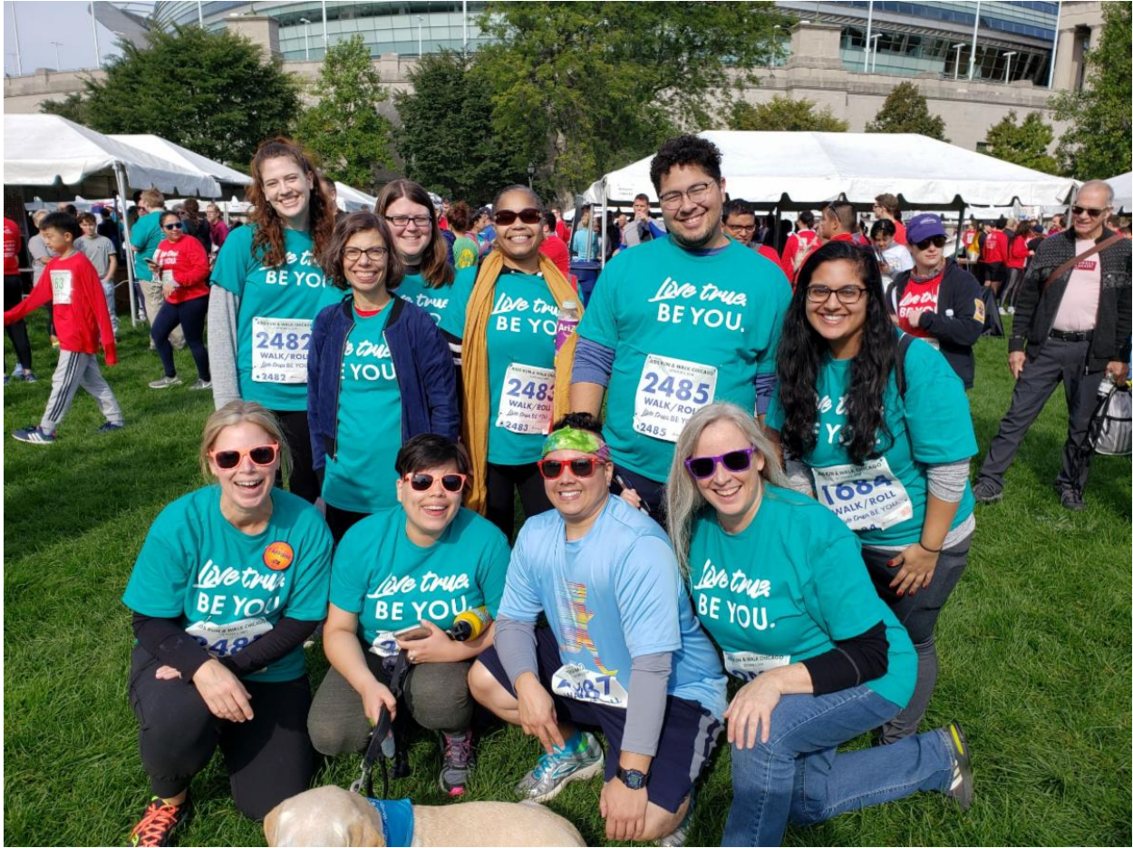
Team PHIMC, 2019 AIDS Run & Walk Chicago

PHIMC staff and supporters joined more than 2,000 HIV advocates, survivors, and community leaders in the AIDS Run & Walk Chicago on October 5. "Live True. Be You." was this year's theme. Beginning at Soldier Field and continuing along the lakefront, this event is AIDS Foundation of Chicago's (AFC) annual fundraiser for programs that decrease stigma, raise awareness about the epidemic, and support healthcare and services for people living with HIV/AIDS. Congratulations to AFC and to everyone involved in making this a successful and vibrant event.