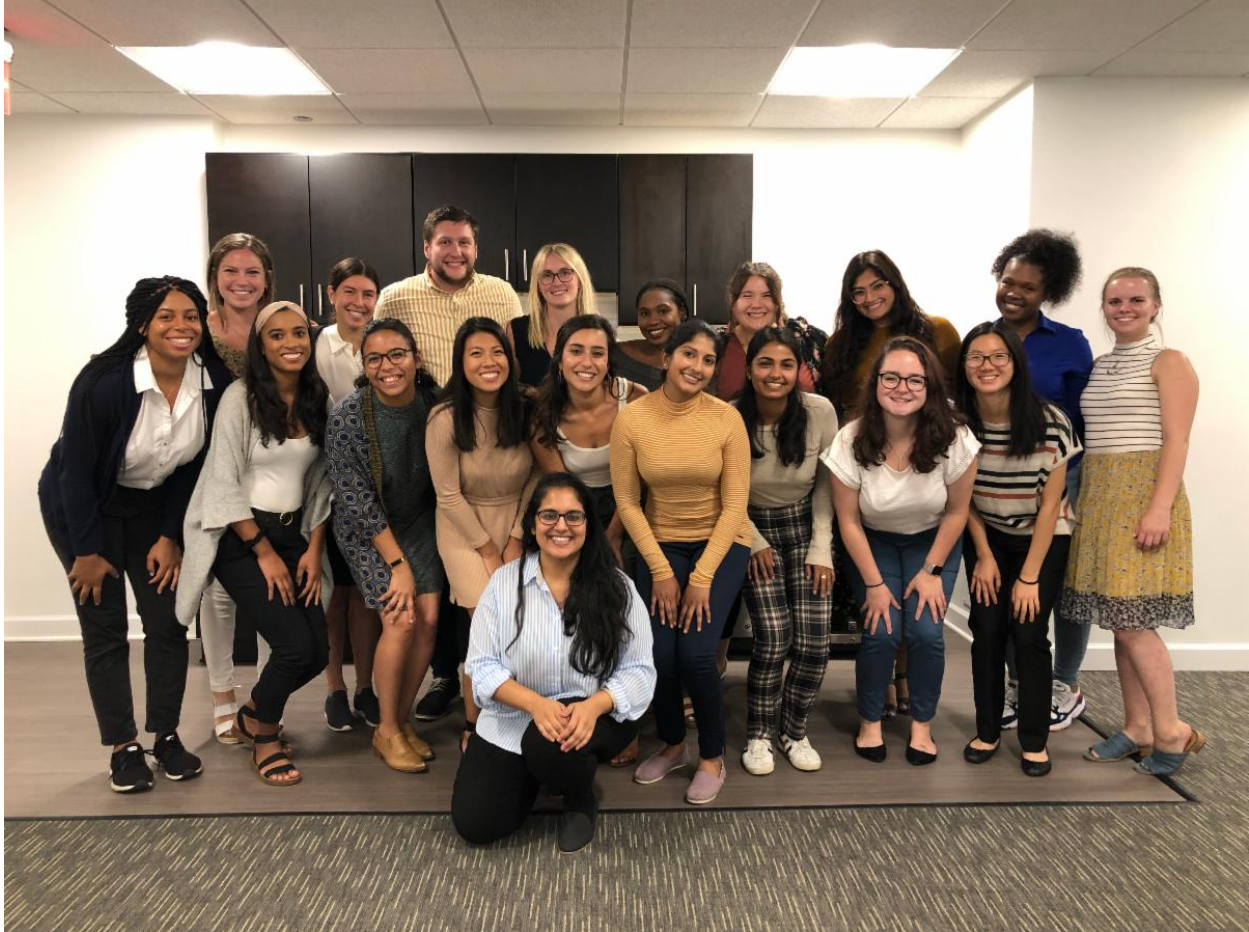
National Health Corps (NHC) Chicago members for the 2019-2020 service term

We are delighted to be collaborating this year with 12 host site organizations : Advocate Children's Hospital, Advocate Trinity Hospital, Erie Family Health Center, Friends of the Park, Girls in the Game, Heartland Health Centers, Illinois Eye Institute - Diabetes Eye Care Center, Illinois Eye Institute - Princeton Vision Clinic, Northwest Side Housing Center, Southwest Organizing Project, Proviso Partners for Health - PHIMC, and Respiratory Health Association.